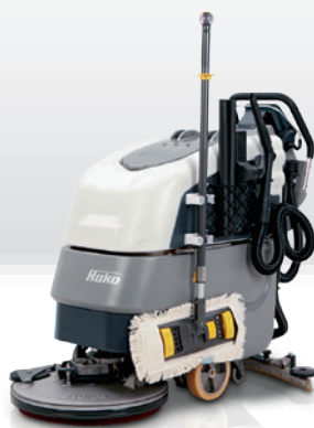
Hakomatic B 45 / CLH