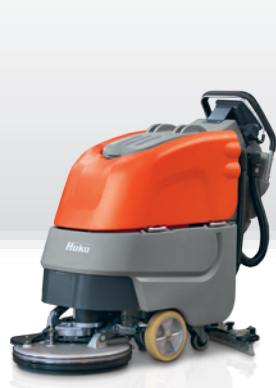
Hakomatic B 30 / CL