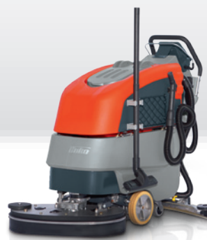
Hakomatic B 45 CL / 65