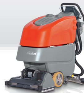
Hakomatic B 45 CL WB